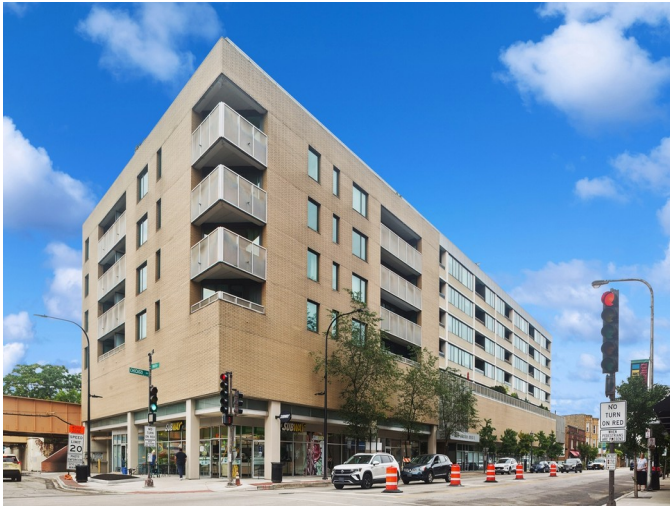
900 CHICAGO AVE.