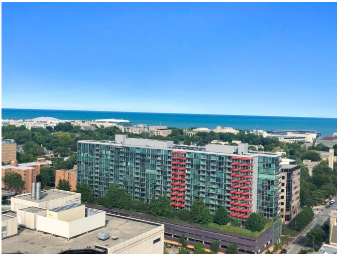
800 ELGIN RD.