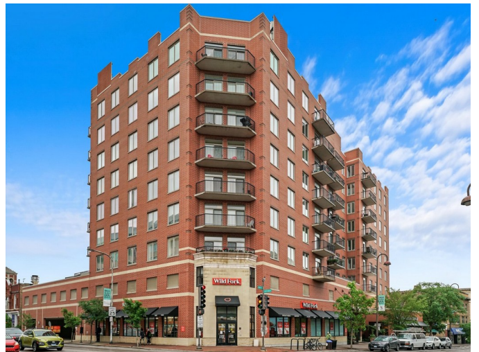
515 MAIN ST.