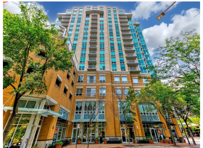
1640 MAPLE AVE.