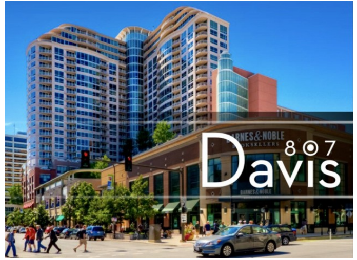
807 DAVIS ST.