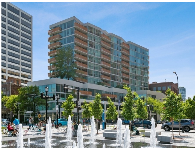
1580 SHERMAN AVE.