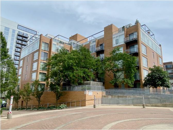
1720 OAK AVE.