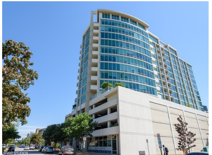
1570 ELMWOOD AVE.