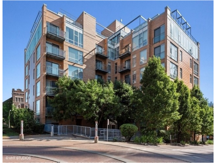
1740 OAK AVE.